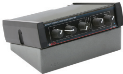
EZ-DC2 WITH AN EZ PRODUCT MOUNTED

Mount the EZ product to the chassis using two screws.