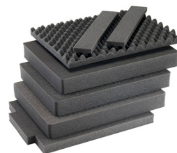
1607AirFS 3 pc. Replacement Foam Set