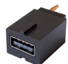
USB (2A) PAG-9712U