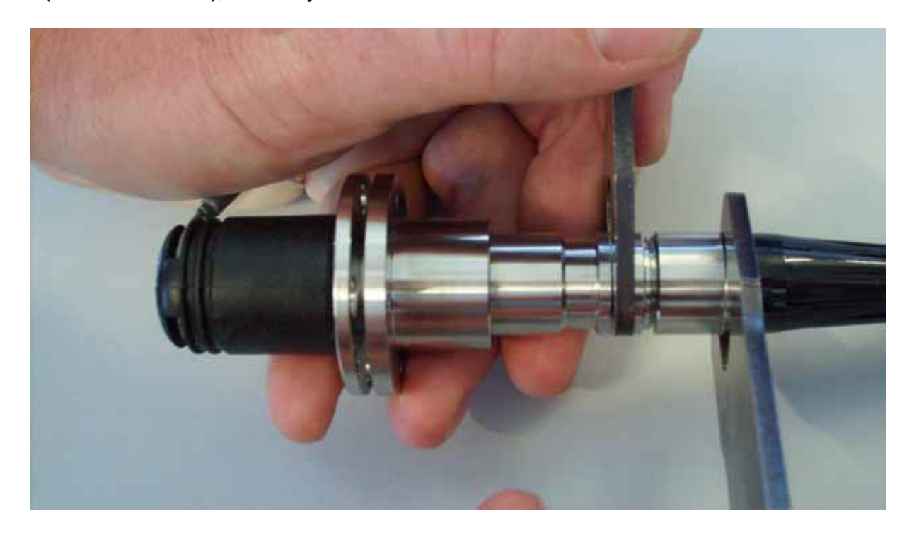
The Quality Choice

2. Holding the connector securely remove the collet nut using the spanners (DCP.91.023.TN), ensure you do not rotate the connector.