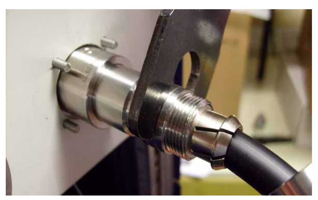
The Quality Choice

9. Using the spanner tighten up the rear extended housing.