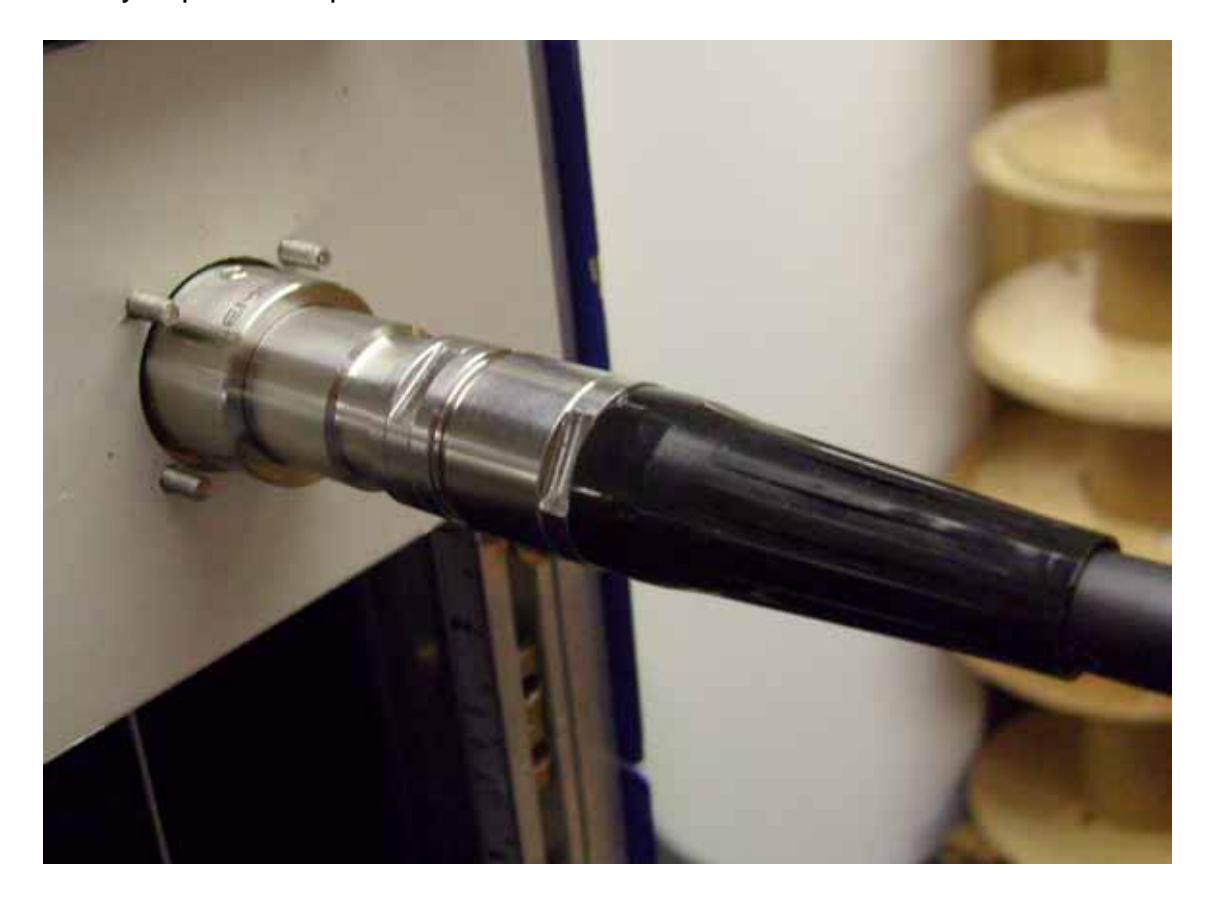
The Quality Choice