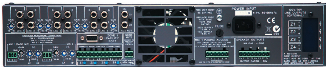
Cloud 46-50 rear view