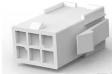
AMP 172160-1 Mate'N'Lock Connector

46-4219 AMP 770985-1 Contact, MATE-N-LOK Series, pin, crimp, brass 22-26 AWG (pack of 20)