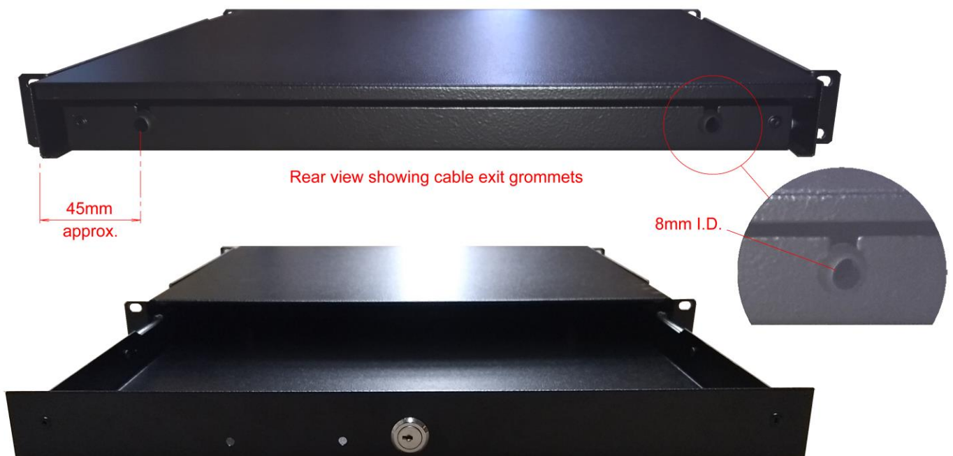
Front view drawer open

Pack of M6 rack bolts, cage nuts & washers.