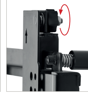
Tool less micro-adjustment of +/-7.5mm at each corner for seamless display alignment