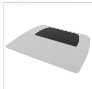
Includes cover plate to hide grab handles once installed