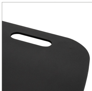
Grab handles allow for easy handling