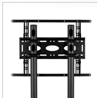
Integrated cable management