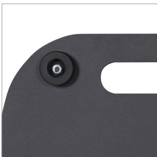
Supplied with non-marking rubber feet for increased stability